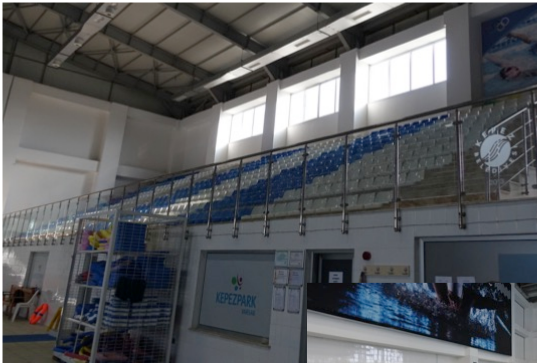
The swimming pool is an excellent facility.